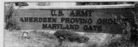
Drivers are greeted by this sign as they drive into the visitors' entrance at the Aberdeen Proving Ground, Md.

calculate the cost with the correct data, the record shows.